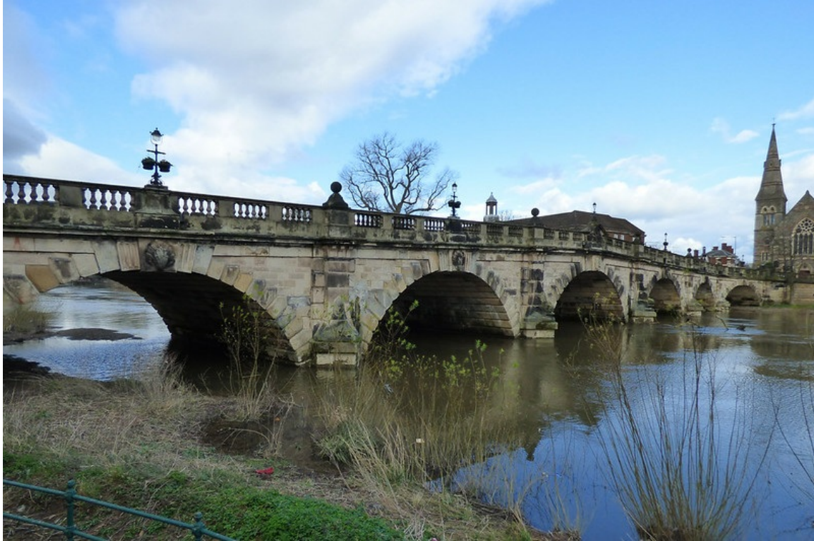
Bridge over River Severn