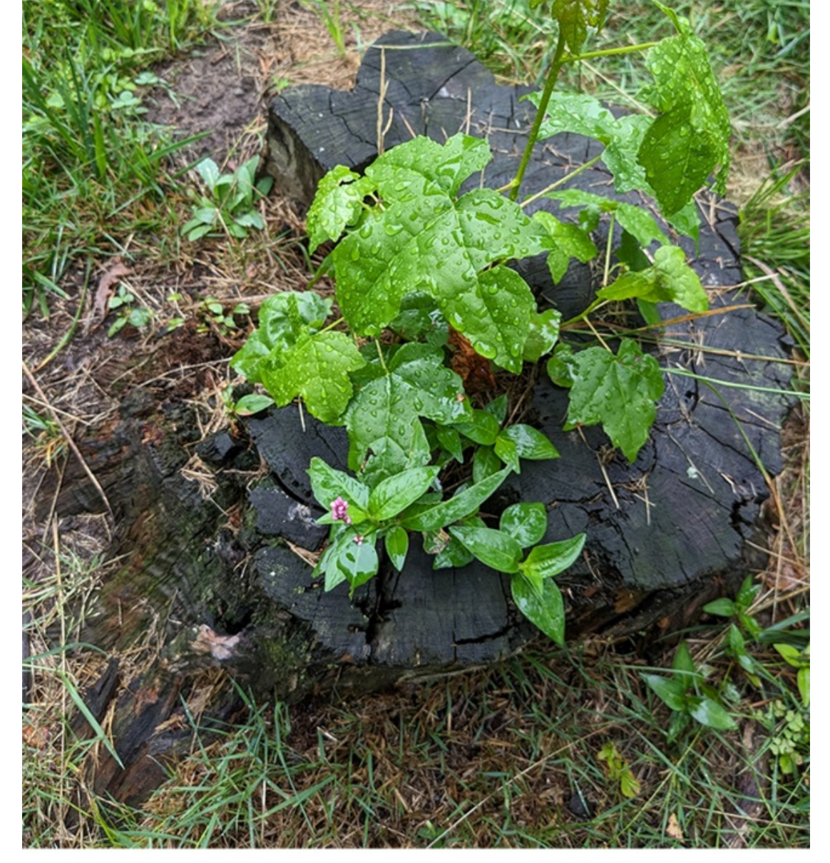
This photo speaks to me of Nature's continuing cycles of life-death-rebirth to new life. It makes me consider how different aspects of my life are in different phases of life-death-rebirth. I also consider my own place in the larger circle of life.