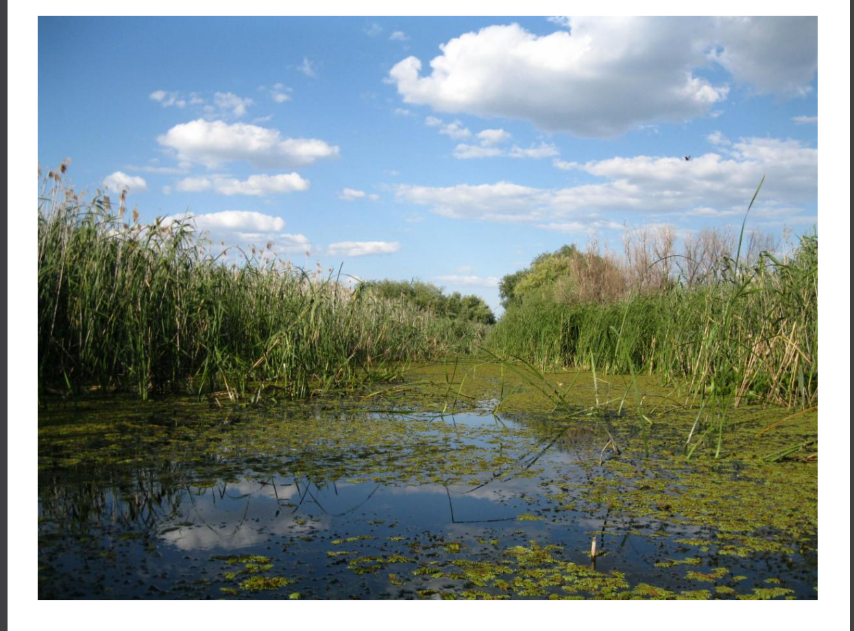
From UN Environmental Program (UNEP)

Wetlands are ecosystems, in which water is the primary factor controlling the environment and the associated plant and animal life. A broad definition of wetlands includes both freshwater and marine and coastal ecosystems, such as all lakes and rivers, underground aquifers, swamps and marshes, wet grasslands, peatlands, oases, estuaries, deltas and tidal flats, mangroves and other coastal areas, coral reefs, and all human-made sites such as fishponds, rice paddies, reservoirs and saltpans.